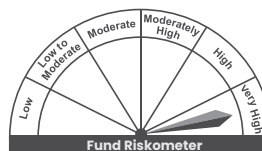
Nippon India Banking & Financial Services Fund

Investors understand that their principal will be at Very High risk