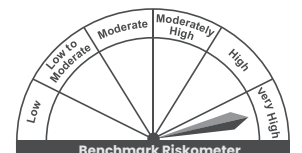
AMFI Tier I Benchmark - Nifty Financial Services TRI

Benchmark Riskometer is at Very High risk