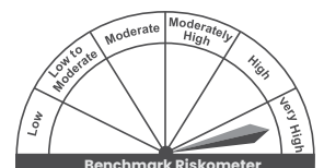
Nifty India Consumption TRI

Benchmark Riskometer is at Very High risk