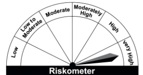
S&P Japan 500 TRI

Benchmark Riskometer is at Very High risk