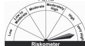
Nippon India Japan Equity Fund

Investors understand that their principal will be at Very High risk