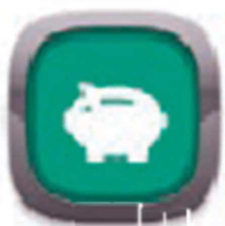
Long term investment