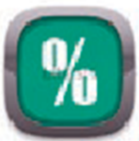
Investment in pure debt securities ^

Aim to enjoy long term benefits of investing in pure debt & money market instruments Including Government Securities .