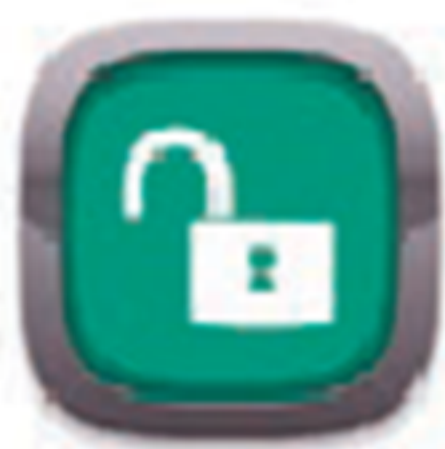
No lock-in period

Contact your Mutual Fund Distributor | Visit mf.nipponindiaim.com | Call 1860 266 0111 # , 91-22-6925 9696 # (For investors outside India)