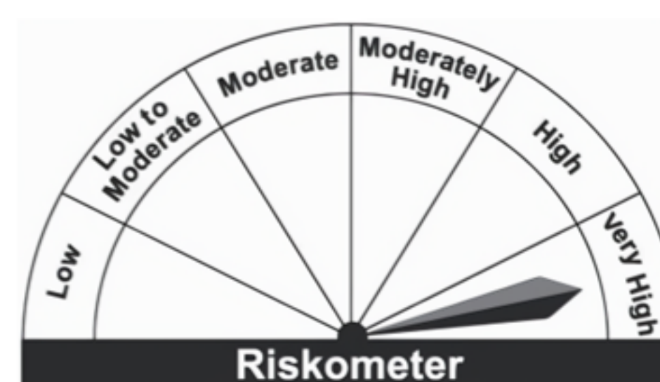
Nippon India Banking & Financial Services Fund

Investors understand that their principal will be at Very High risk